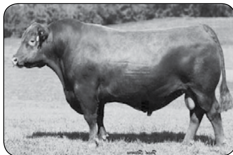
Sire of Lot 80

WW: 669 lbs. Here is a real classy Cheyenne son that will turn some heads sale day. He is a dark cherry red bull that has a lot of style, length, and a super pedigree. He goes back to the great Lakina cow line and EBV as well. In my opinion, Cheyenne is one of the best Cherokee sons available and it shows with this guy. Come have a look and take him home.