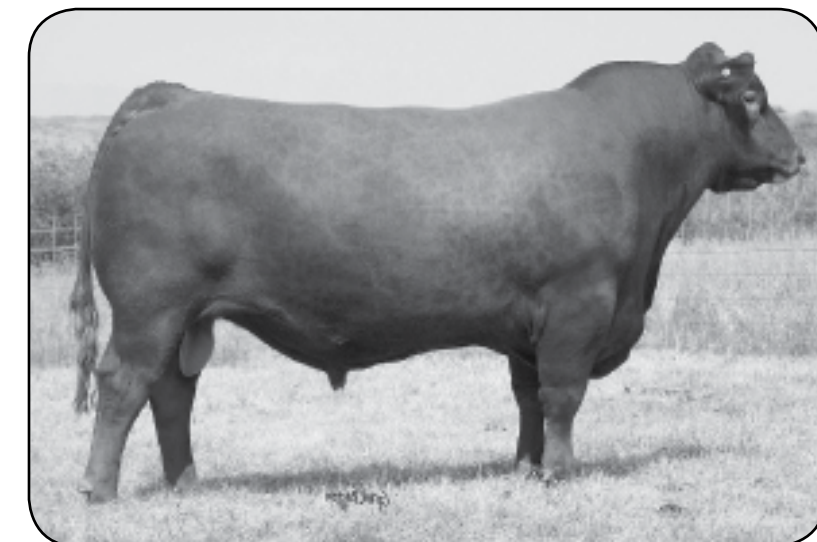
Sire to Lots 62-67

These full brothers will really put some class into your next calf crop. They are again sired by Mullberry, and out of donor cow ATKN Coppertop 0246. She is a top cow out of the Atkins Red Angus program that goes back to LMG Daorv 841, and Rambo Tuo. Dad saw Rambo Tuo when he was a two year old and he thought he was one of the best bulls he had ever seen. He is a son of Rambo 502 and has done a real good job. These could be your next herd bulls.