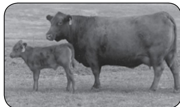
Dam of Lot 61