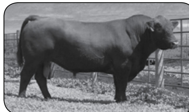
Sire of Lots 2 - 8