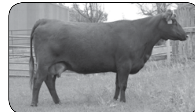
Dam of Lots 2 - 8