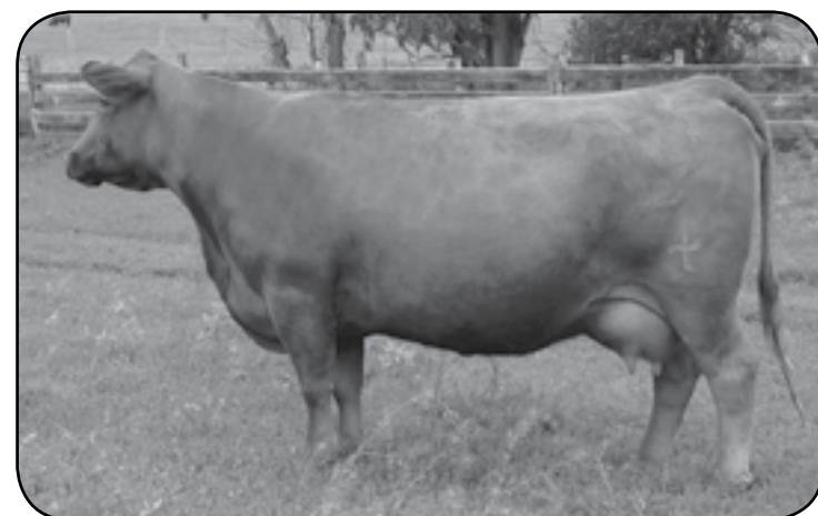
Sara 328-817 - Dam of Lot 21

WW: 715 lbs. The maternal grand sire in his day was one of the higher performing bulls the breed had, when no one really paid a lot of attention to EPDs, he already had them. He earned them as the calves were powerful and he was proven. 121R added a lot of muscle to this guy and 7802 will really add the pounds to your next calf crop!