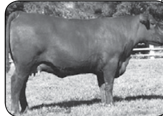
Dam of Lots 75 & 76