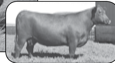
Maternal Sister of Lots 40-47