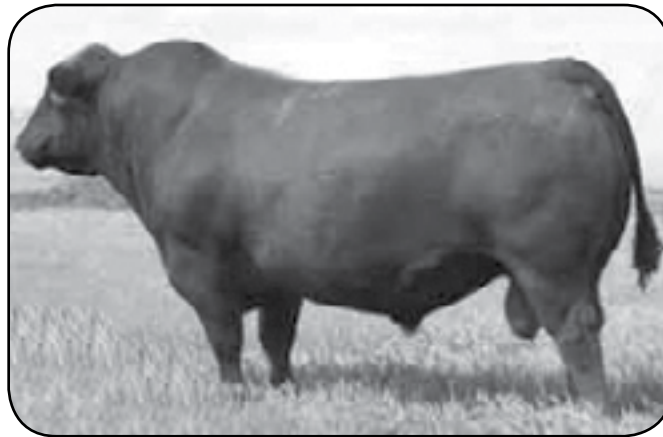
Sire of Lots 70-74