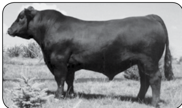
Sire of Lots 54 & 55

Here is a muscle machine that will really attract the calf buyers sale day. He will add muscle and length to your next calf crop. His sire is the real thick made, classy looking Perks Advance 121R that flat out gets it done. You will love this guys calves and the feeder calf buyers who gets a hold of his sons will come back looking for more next year. Pen 7