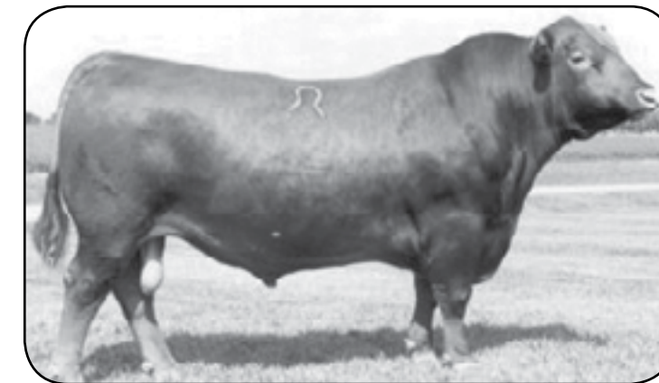
Sire of Lots 16, 17, & 18

Daorv 0248 has several sons selling throughout this entire auction. I would try to grab several full or half brothers and try to get some real consistent sons and daughters. Consistency always sells at the top, and when you add top quality, it gets even better. So why not raise the best, most even cattle possible. The sire to these three bulls is none other than the late LCHMN Grand Canyon 1244G. This guy is one of the best cow makers the breed has ever seen. His semen is very rare and daughters are getting extremely sought after. His dam is one of the top cows in the breed and also raised Major League and several top daughters throughout the industry. Take these bulls home and make yourself some top cows!