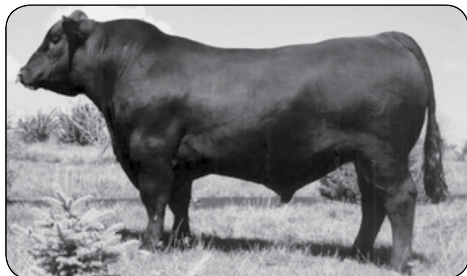
Advance 121R - Sire of Lots 19, 20, & 21