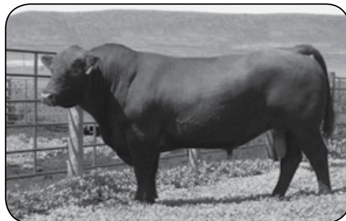
Sire of Lots 28-34

BW: 86 lbs. WW: 608 lbs. 7815 is the last fall bull selling here today, and boy is it a good way to end. He is stout made and has a great look to him.