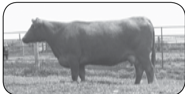
Dam of Lot 1