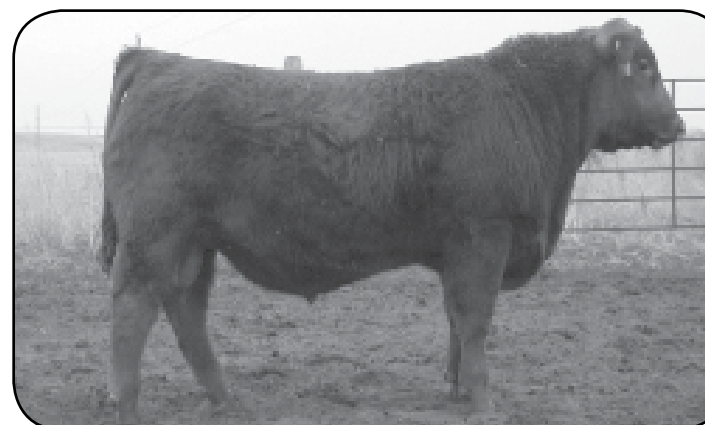
Sire of Lot 81

BW: 76 lbs. WW: 712 lbs. Retaining 50% possession and 50% semen interest. Here is a natural born calf out of a first calf heifer that just happens to be a daughter of the great LMG Miss Dynette 902. He has done a super job keeping up with the big boys since he came out of a first calf heifer. It just shows how good this Dynette line really is. His sire is from another top cow line here at Gill Red Angus. He is out of the Sara cow line that has gained the whole industries respect the last couple years. With both Sara 817 and Sara 015 in this pedigree along with Dynette 902, you absolutely can't go wrong. Plus when you study this pedigree you will find LMG Poteet 419, she marks the 4th cow in this pedigree that has been flushed here at Gill Red Angus. If you want to make some great cows, this is the bull to buy as they will be easy keeping and awesome producers!