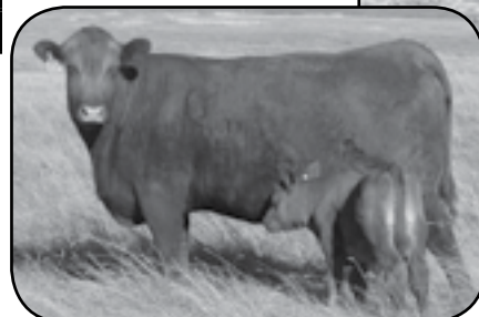
Dynette 902 - Dam of Lots 9, 10, & 11