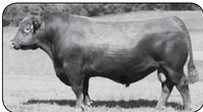
Sire of Lots 12 & 13

These two bulls and a full brother, which sells as lot 80, are some of the top genetics in the breed, old and new. The dam is one of the original BJR Blockana cows that has developed a great reputation throughout the breed. Several breeders have chased these cows and are flushing them from the East to the West and they are all selling right at the top of the breed as well. Red Spread is a top performance and maternal bull that really makes some top producing cows. These bulls have a lot of power to get the job done in the lot and the maternal characteristics to get it done in the pasture. Come get these guys.