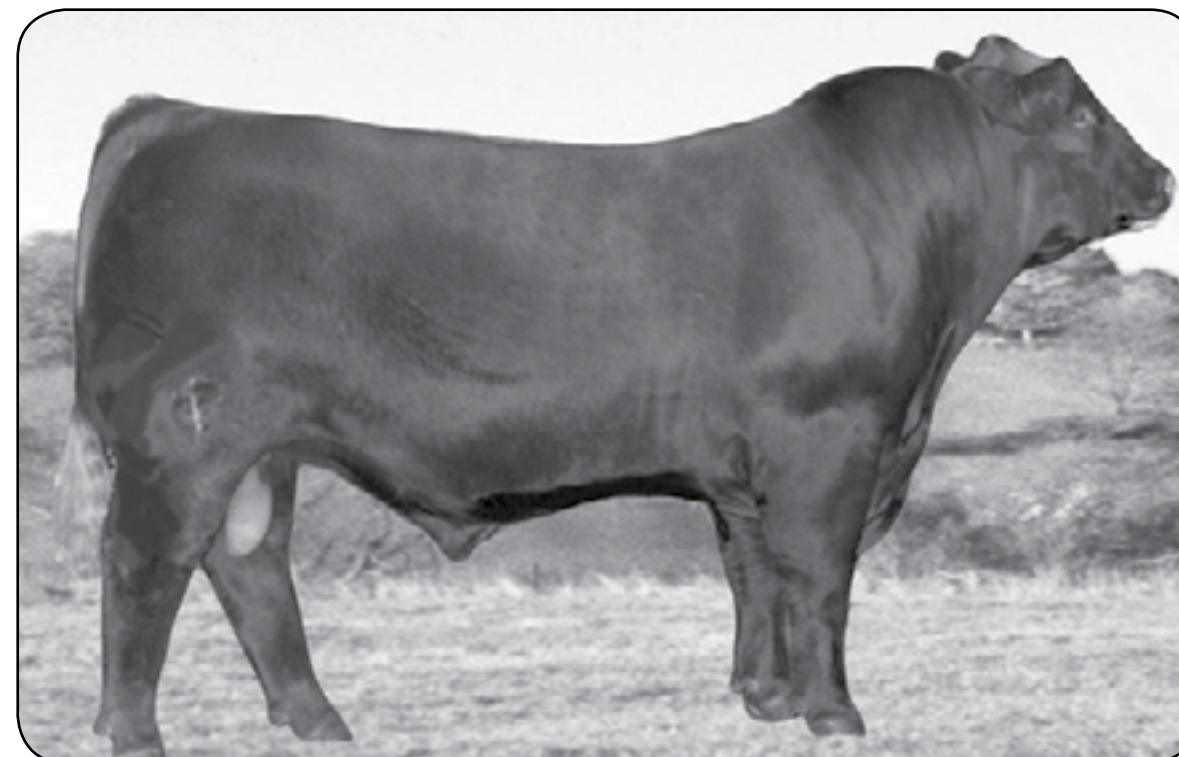
Perks Chateau 309R - Sire of Lots 22 & 23

WW: 683 lbs. Here are some older and rare genetics. The sire is the late great Rambo 502 bull that really did the breed a lot of good over the years. One of our very top cows is a Rambo 502 daughter and is still producing right at the top at 11 years of age. The dam to this bull is also 11 years old and is a top Red Lightning daughter that is right at the beginning of the BJR Bonnebell cow family. This guy should make some super daughters as well.