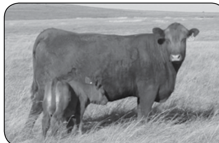
Maternal Grand Dam of Lot 81