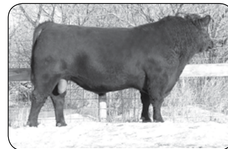
Sire of Lots 56 - 61

Here are 5 full brothers sired by the powerful VGW Rattler 908 and out of donor cow, DAORV 0248. This cow has done a super job, and you can see by all of her sons selling here that we think she is pretty special. She is a direct daughter to LMG Daorv 841 and VC Chief 105. These two have done an absolute great job and is as proven as you will find. Plus Rattler has made quite the name for himself as well. Our customers can't get enough of him as he will really add the pounds to his offspring as weaning time. These 5 bulls were not all raised on the same ranch and were out of different types of recip cows. Some are filled out more than others and it is due to the quality of grass they were summered on. A couple came in greener than the others, but they are starting to catch up now, but won't be caught up completely by sale day. So remember they are all the exact same genetics and should produce the same type of cattle. If I was looking to make some consistent commercial calves, I would purchase all of the bulls and raise the most even set of steers and heifers calves ever. You won't regret it. There are some real studs in this pen!