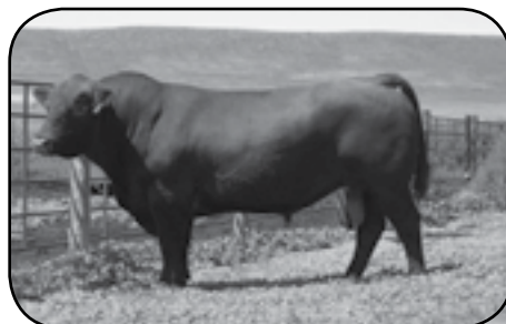
Sire of Lots 25 & 26

BW: 76 lbs. WW: 758 lbs. What a heck of a way to start off these natural born fall bulls. This Accelerator son really puts it together right. He is long bodied, thick quartered, good top line, great feet, and out of a real good cow. She has a 105 MPPA and goes back to a former donor cow for us, LMG MTX 715. We have sold several sons and daughters out of her as well. This guy would look great standing in your pasture.