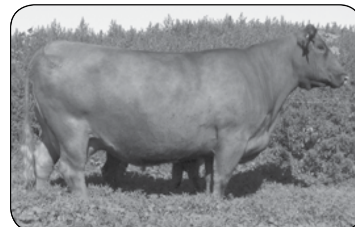
Dam to Lot 81's Sire