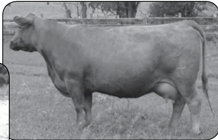
Dam of Lots 37, 38, & 39