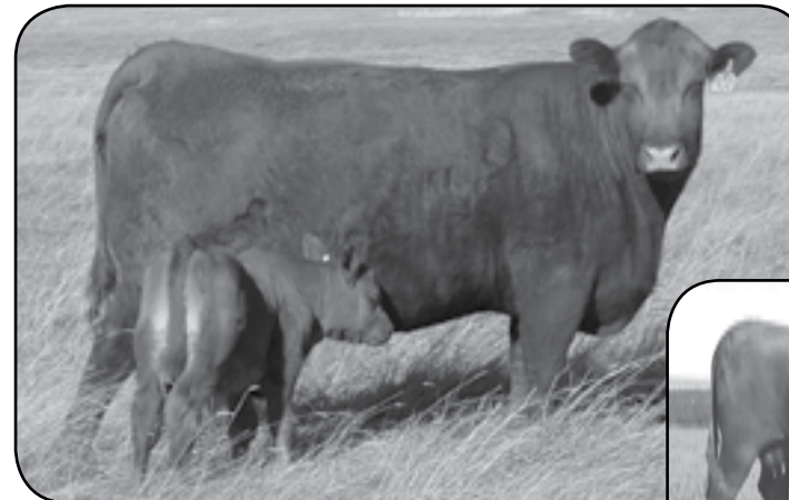
Dam of Lots 40-47