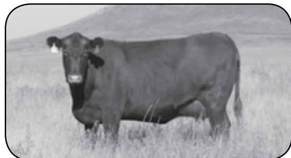
Maternal Sister of Lot 1