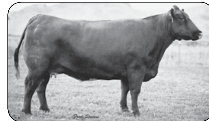
LMG Daorv 841 - Maternal Grand Dam of Lots 14-18

The Daorv cow family will never let you down. LMG Daorv was born right here at Gill Red Angus and sold later to Forster Red Angus from North Dakota. He later sold sons and daughters all over North America, with the top one selling for $50,000. (I wish we would have kept her) Cheyenne in my opinion is possibly the best Cherokee Canyon son out there. He really adds a lot of class and makes some very good daughters. These two bulls are very good, long made and deep bodied. They are real similar in style and I am sure you will like them as well.