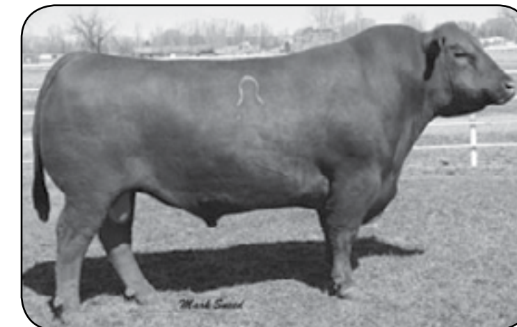
Sire of Lots 68 & 69