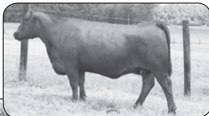
Dam of Lot 55

Here is another very classy made bull and son to Perks Advance 121R. He definitely gets an A+ for style and muscle. It was pretty easy taking his photo as you can see he is pretty photogenic. His dam is a grand daughter of LMG Daorv 841 and a daughter of LCC King Rob 8621. With that pedigree, there is no wandering why he is so good. Come get this classy made, thick quartered bull. Pen 7