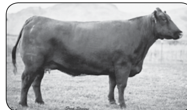
Maternal Grand Dam of Lots 56 - 60