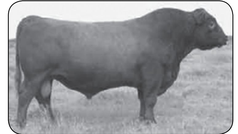
Sire of Lots 51, 52, & 53

These three full brothers are sons of OHRR Dakota Copper 29K. I have seen several sons and daughters out of Dakota Copper and they are pretty darn good. Daughters are made right and have super udders and sons are soggy made and produce easy doing daughters. The commercial ranchers love these guys as they produce the kind of sons and daughters that keep them in business. We are using a son of Dakota Copper pretty hard on our summer cowherd and the sons were accepted very well by the cowboys last fall. I think you will like these as well. Pen 7