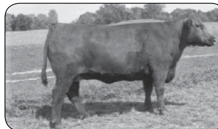
Dam of Lots 56 - 60