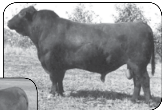
Red Knight - Sire of Lots 9, 10 & 11