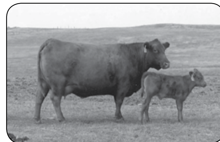
Grand Dam to Lot 81's Sire