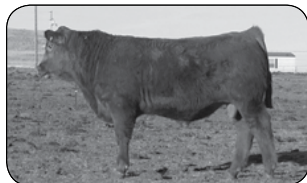
Full Brother of Lot 61