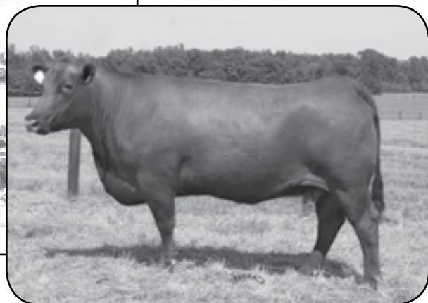
Dam of Lot 66