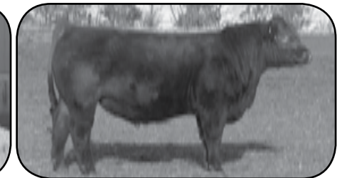
Maternal Brother of Lots 40-47